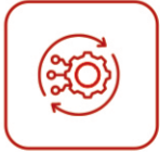
Inventory & Software