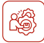
Production Planning & Control