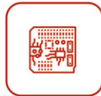
Bare PCB Manufacturing