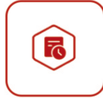
Planning & Purchase